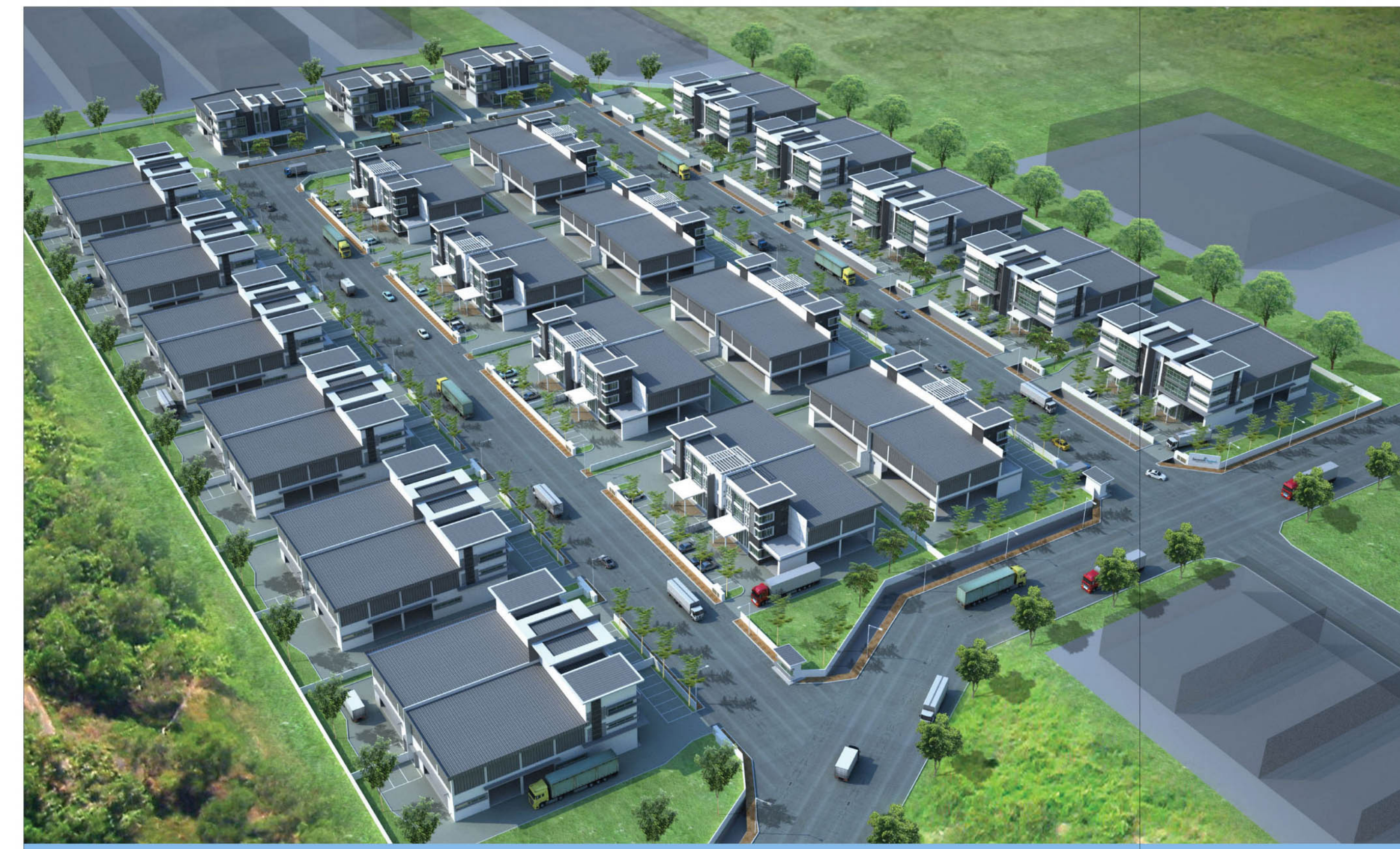
Master Site Plan 工业位置图