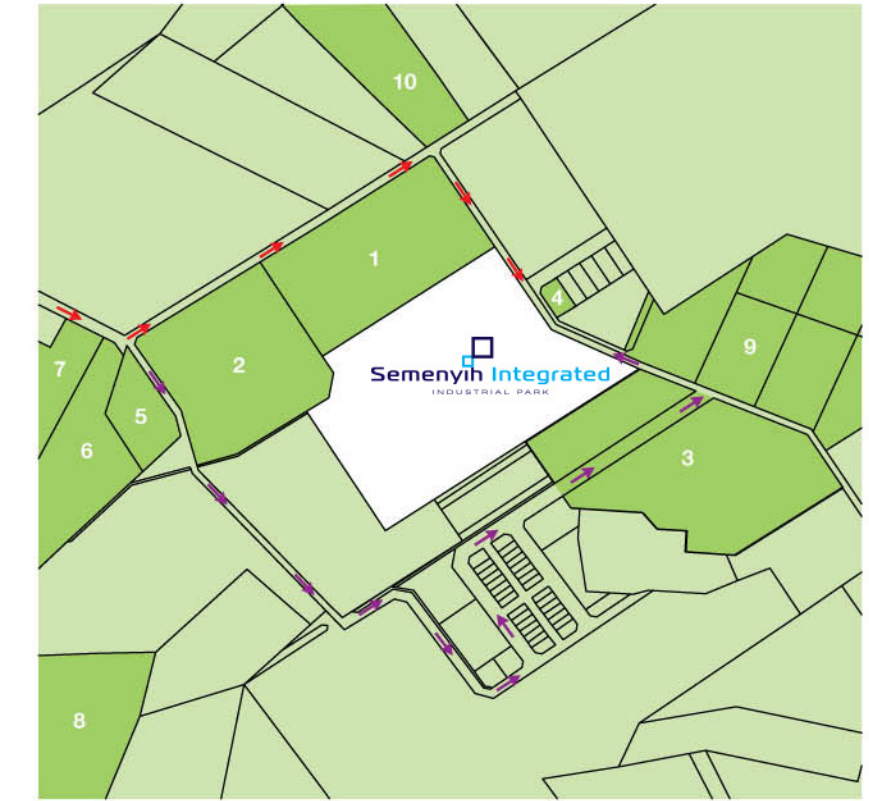
Well Established Industrial Neighbourhood 发展蓬勃的周边工业区